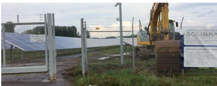
The door is open to the solar field, anybody can walk in.

The requirements on devices for insulation resistance measurement are described in the standard IEC 61557-2:2007. These devices normally operate at a measuring voltage of 500 V or even 1000 V, such that mostly the complete low voltage system with all its equipment and the protective and monitoring devices is not measured or tested, often only a cable. To undertake an insulation resistance measurement as a periodic test in a photovoltaic system a level of effort that should not be underestimated is required to configure the system for the measurement. As based on the current state-of-the-art the part of the installation related to the photovoltaic generators cannot be powered down, an insulation resistance measurement as periodic test in photovoltaic installations is not really practical.