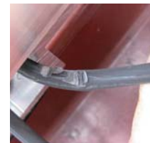
Fig. 1: Overview of the evaluation