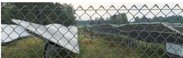
Unauthorised people (family with children) are walking around in the solar field without knowing the dangers lurking around.