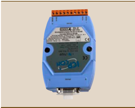
Interface converter DI-2USB