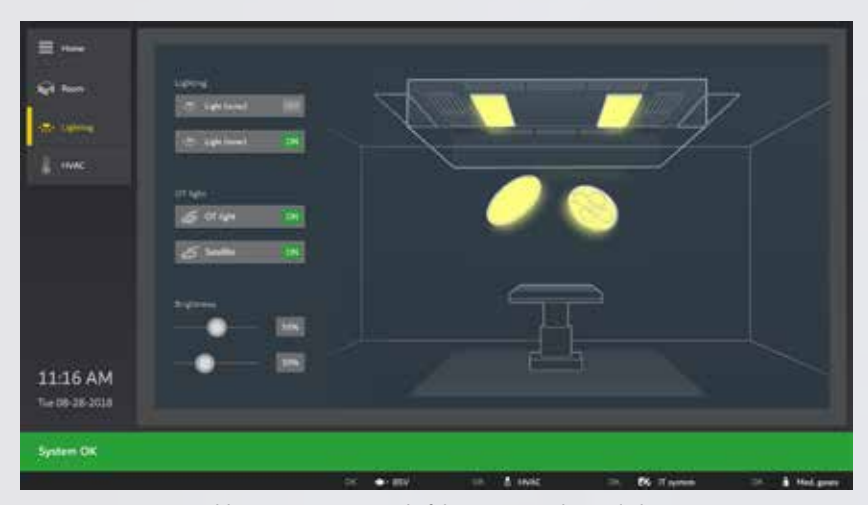
COMTRAXX® CP9xx enables convenient control of the operating theatre lights

The safety of patients and staff has the highest priority in operating theatres and other intensive care units. The COMTRAXX® CP9xx series is the ideal monitoring and control solution for operating theatres and reliably ensures uninterrupted operation.